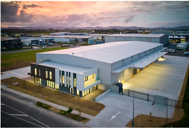
The NZ Windows building (3818m 2 office/warehouse) was completed in March this year. It was the second DBL for the company within Te Rapa Gateway. This particular building won a Merit award at this month's annual Property Industry Awards in Auckland.