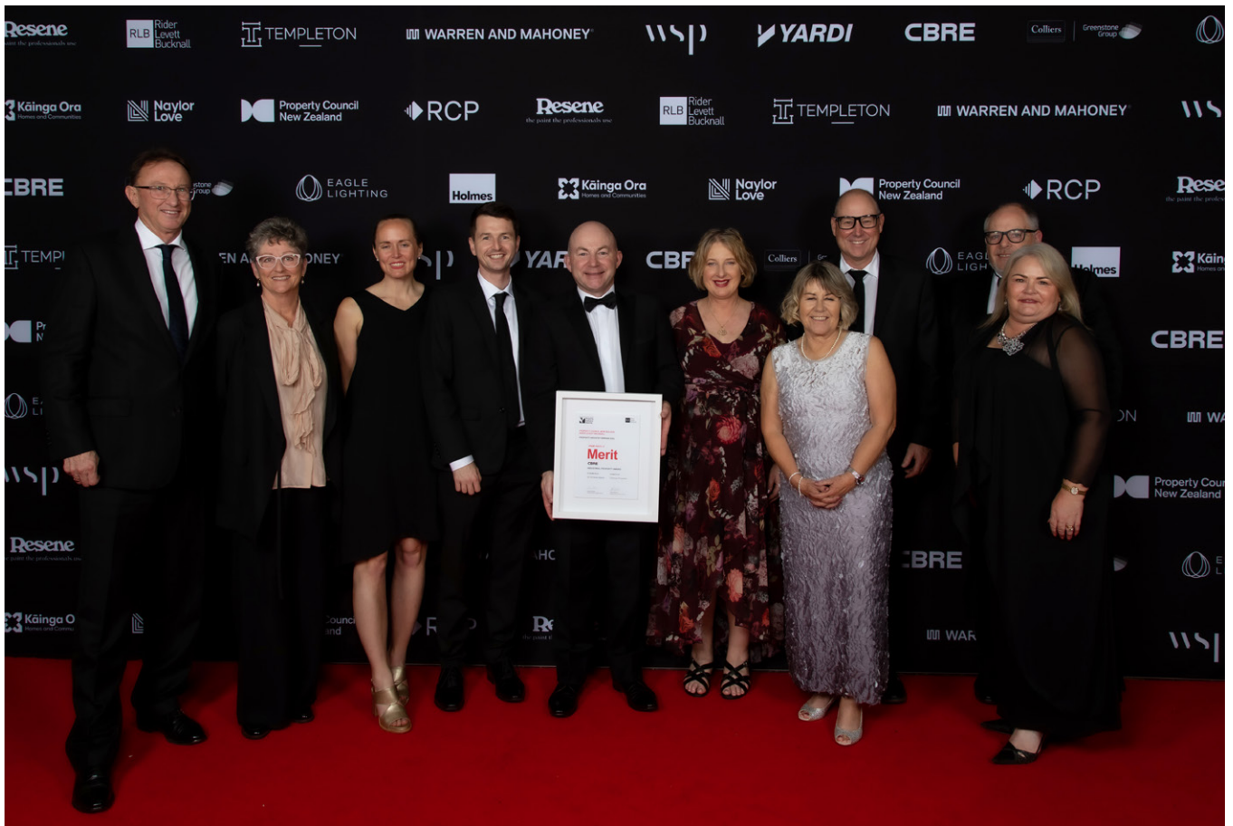
Just days ago, Chalmers Properties won a Merit at the annual Property Industry Awards in Auckland for the NZ Windows built.