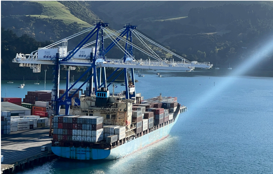
The Nicolai Maersk on 28 April. She was the first vessel to berth as part of Maersk's new weekly Trans-Tasman Polaris service.

The second quarter of the year saw South Island exporters supported with the introduction of two new weekly services into Port Chalmers.