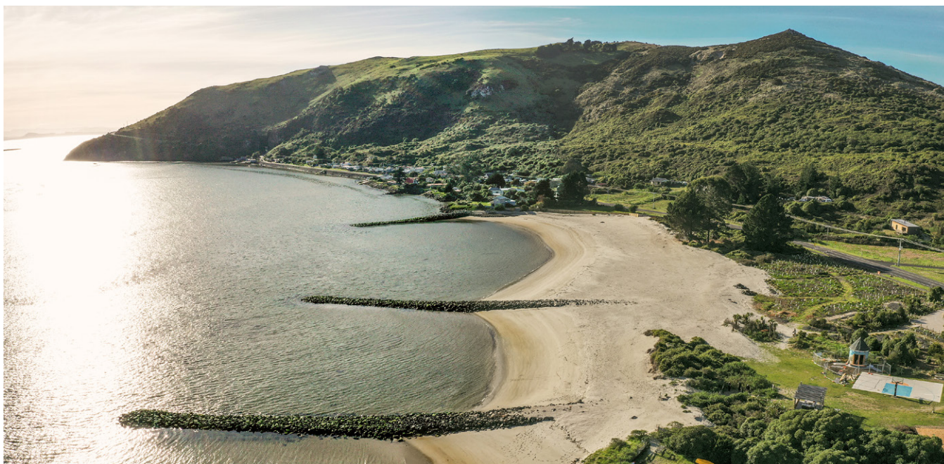
Te Rauone Beach, 31 May 2023.

The Te Rauone Beach community, who were instrumental in driving the project, are still going hard out to make the beach and surrounds a place they can be proud of. Earlier this year, they built a 100-metre long fence to prevent people crossing Ray’s property to access the beach, and have been planting native plants around the carpark and playground area.