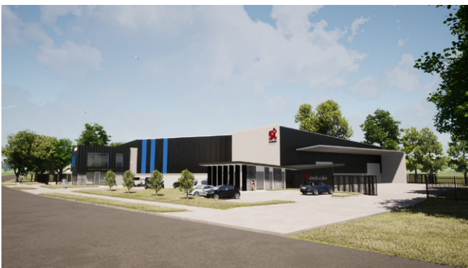
Te Rapa Gateway's Steel and Tube building – due for completion February 2024 – is the third DBL for the client. The first was in Fryatt Street, Dunedin; the second was in Te Rapa Gateway and houses the company's Distribution & Reinforcing business. The current build (2299m 2 office/warehouse) is immediately beside the existing premises and will be home to the Hamilton Roofing division.