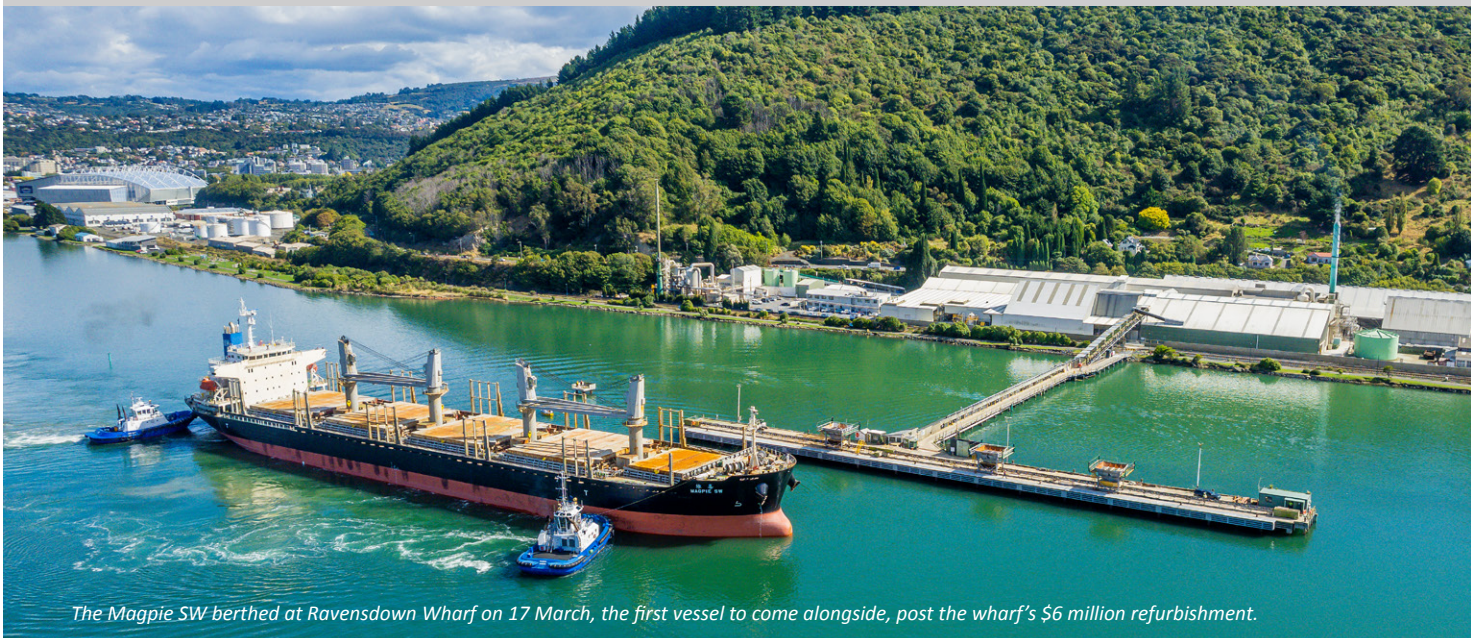
The Magpie SW berthed at Ravensdown Wharf on 17 March, the first vessel to come alongside, post the wharf's $6 million refurbishment.