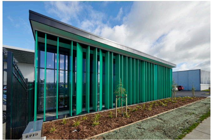
The Spectrum Aluminum build (4146m 2 office/warehouse) has just been completed this month – the company's first DBL with Chalmers Properties.