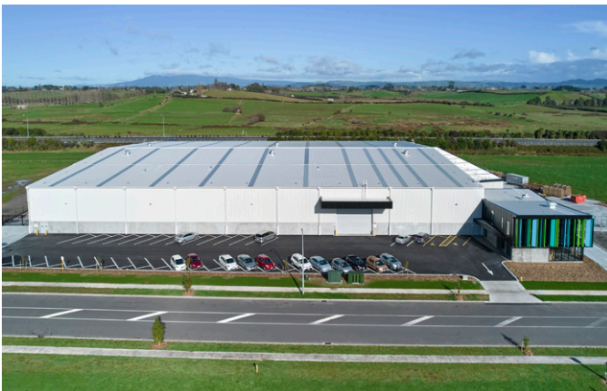
The Altus building was completed in May this year and is Chalmers Properties' largest DBL to date, at 6873m 2 (warehouse and office).