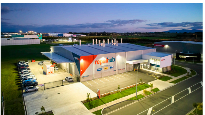
Completed in January 2022, the IAG Repairhub was the first DBL for the client. The 2245m 2 office/warehouse development won a Merit award at the 2022 Property Industry Awards.